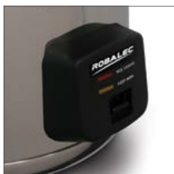
Keep-warm function keeps rice warm