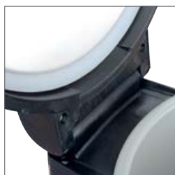
Gasket sealing lid