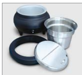
Can be taken apart for easy cleaning