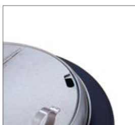
Opening to accommodate ladle while lid closed