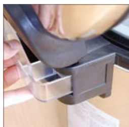
Steam drainage system with catchment container for emptying