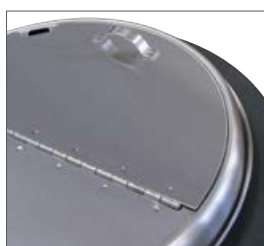
Hinged lid for stirring and serving