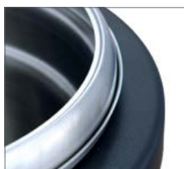
Specially designed rim to allow condensation to go back into soup