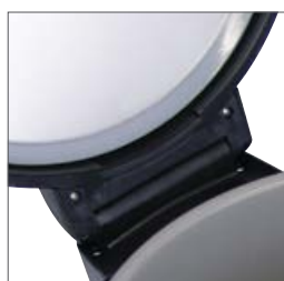
Gasket sealing lid