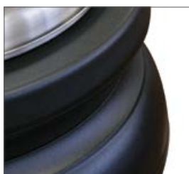
Glass filled nylon outer casing for reduced heat transfer