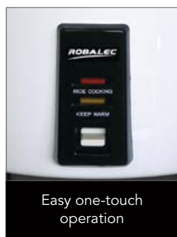
Easy one-touch operation