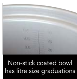
Non-stick coated bowl has litre size graduations