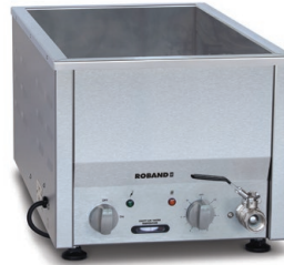
BM21 pictured. (narrow footprint)