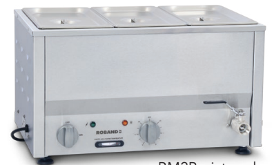
BM2B pictured. (wide footprint)