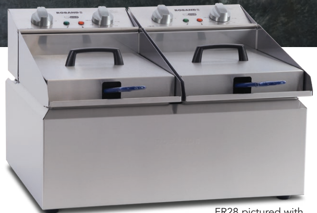
FR28 pictured with pan covers