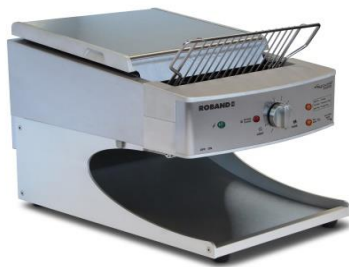
SYCLOID CONVEYOR TOASTER