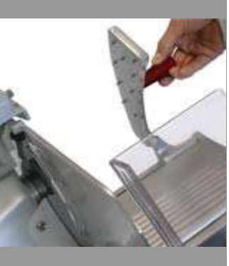
of food product