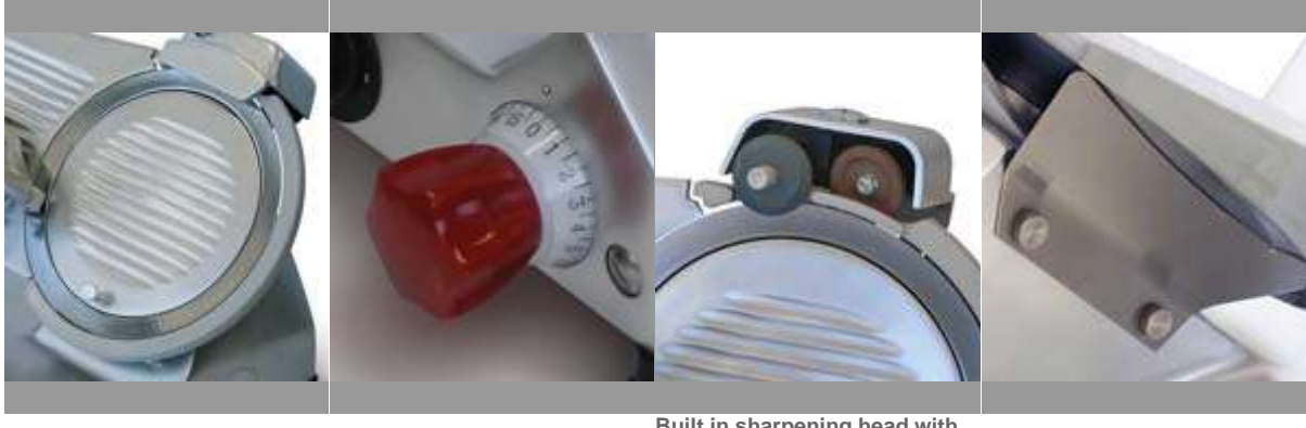
Full blade edge ring-guard for complete protection even while adjustment knob, graduated in cleaning Built in sha on all models

Medium Duty Food slicer - NS220. NS250 & NS300 look the same, but larger.