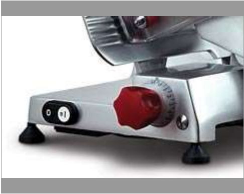
Spiked meat grip for firm control Sturdy base for medium duty slicers