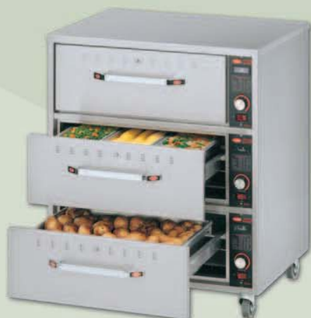
Model HDW-3 with optional casters