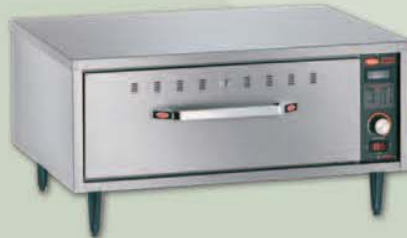
Model HDW-1 with standard 4" (102 mm) legs