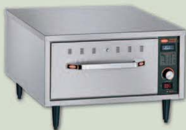
Model HDW-1N with standard 4" (102 mm) legs