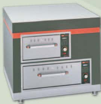
Model HDW-1BN and Model HDW-1B built-in units; trim ring included for easy installation