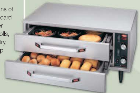
Model HDW-1R2 with standard 4" (102 mm) legs

Expand holding capacities with more pans of food in the same space as a single standard drawer model using Hatco's Split Drawer Warmer. Ideal for casseroles, pot pies, rolls, nacho chips, potatoes, vegetables, poultry, meat, and desserts in 2 1/2" (64 mm) deep food pans that lift straight out.