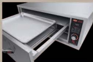
Biscuit Pan Drawer