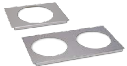
BMH1 & BMH2 pictured