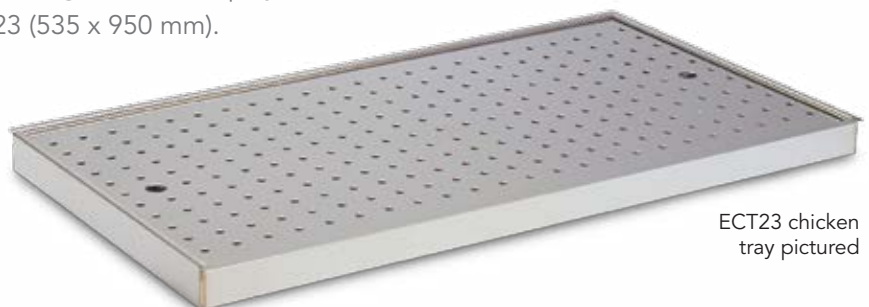
ECT23 chicken tray pictured