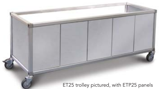
ET25 trolley pictured, with ETP25 panels

High quality stainless steel panels are available to suit each trolley size, improving the aesthetics and functionality of any given display application. Panels enclose the front and both ends of the corresponding sized trolley. Models ETP22, 23, 24, 25 and 26.