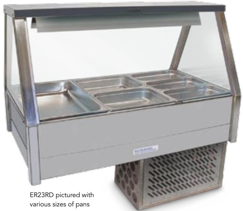
ER23RD pictured with various sizes of pans

Adjustable digital thermostat, 0°C to 8°C