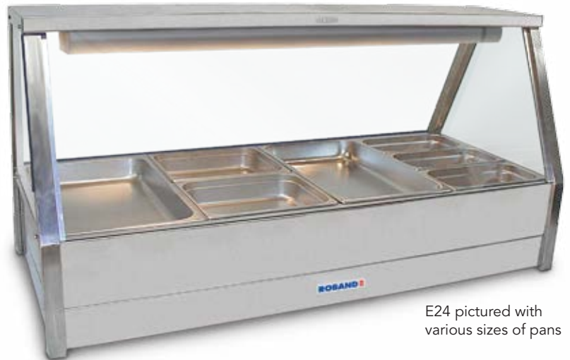
E24 pictured with various sizes of pans

These double row hot food display bars have streamlined styling that will enhance food presentation whilst keeping the food at the correct serving temperature. A wide range of sizes and options are available to cater for numerous combinations of gastronorm pans up to 100 mm deep. Set of 1/2 size 65 mm pans included.